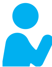
People with underlying medical conditions

Chronic liver disease Cancer Cardiovascular illness etc.