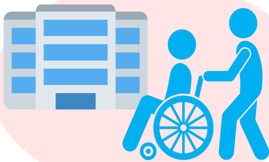
Medical institutions and nursing homes